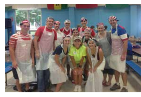
James Madison Institute staff helped assemble food for families in need at "A Full Summer."

More than 114,900 people live in poverty in the Big Bend area where the James Madison Institute headquarters is located. Of those, 29,400 are children. Summer is a critical time for children who depend on free or reduced-price school lunches. When school is out, many of these children do