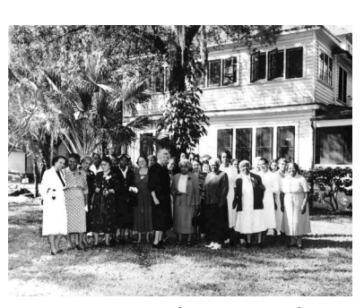
Bethune-Cookman College

her child, she doesn't typically sit on her hands and settle for status quo mediocrity. She seeks to enroll her child in that program. We see this all the time with extracurricular activities (like youth sports) where parents have agency. And we'd see it even more in K-12 education if parents could direct how their child's perpupil dollars were allocated.